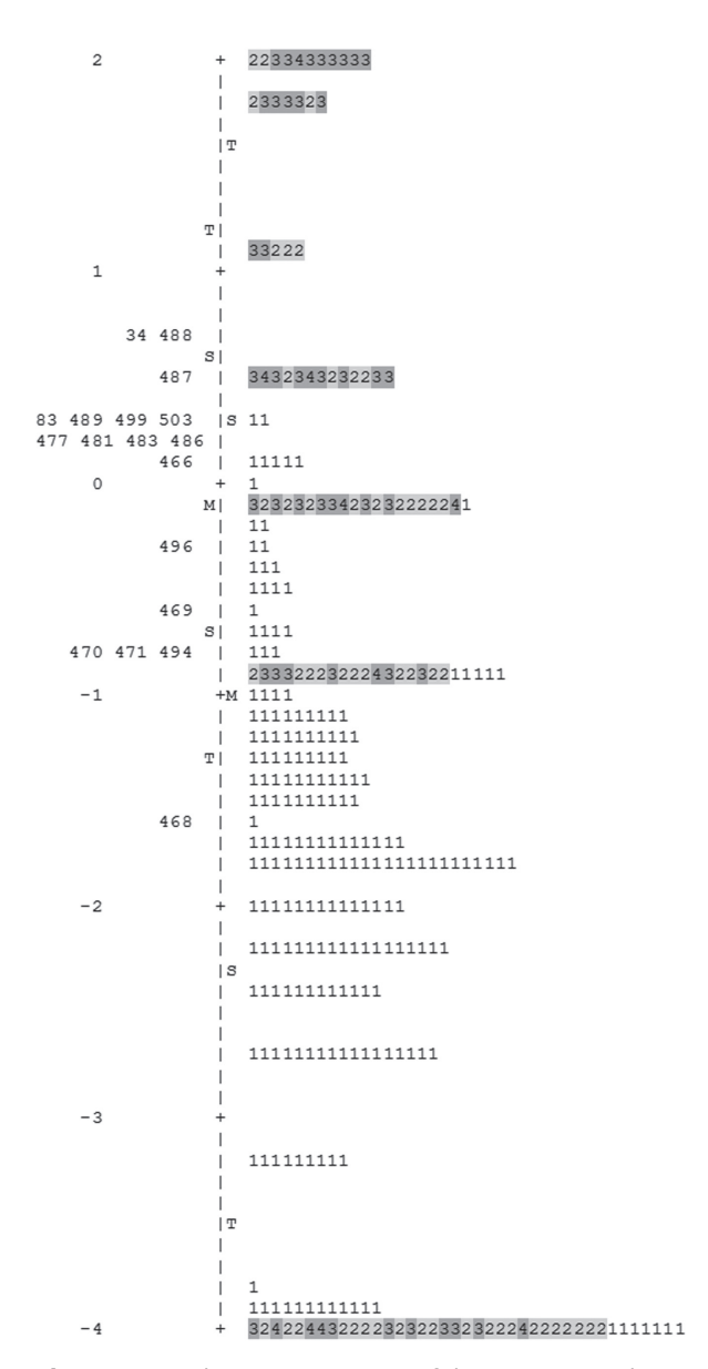
Figure 2 - Wright item-person map of the criticism avoidance dimension

whether or not they had comorbidities. Complementary to these data, we performed ANOVA using only the sample included in the analysis in Figure 2, observing the ability of the criticism avoidance dimension to discriminate the groups according to severity of avoidant functioning, which can help establish a cut-off for this dimension of the IDCP, along with the other data presented. Table 3 shows the results of ANOVA post hoc comparisons for the four groups and Cohen's d for peerto-peer comparisons.