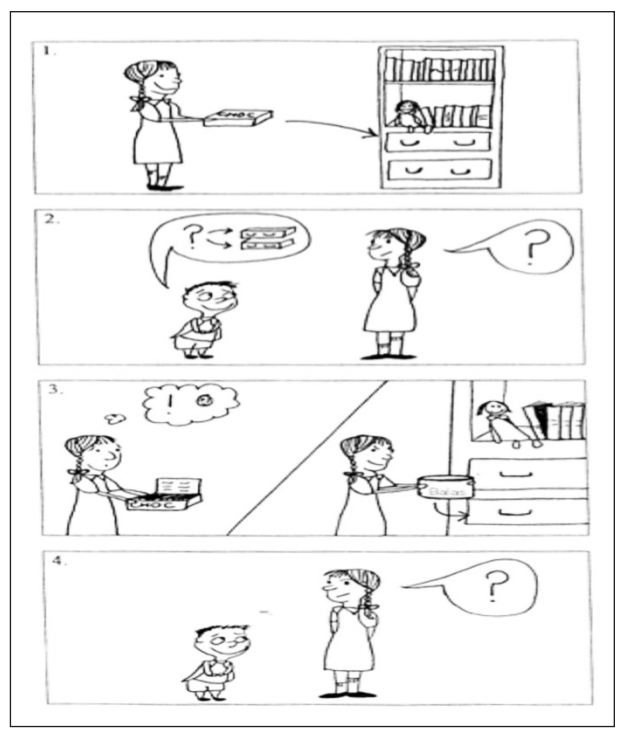
Figure 1 – Cartoons illustrating one of the stories of the Theory of Mind Stories

The ToM Stories is a classic false belief task. It includes first- and second-order reasoning questions and comprises six sketches or stories. The instrument was developed by Frith & Corcoran<sup>3</sup> and subsequently revised by Moore et al.15 Each sketch is accompanied by cartoons to ensure that the subject will receive both verbal and visual stimuli<sup>5</sup>; each story is aimed at assessing specific aspects involved in ToM processes (Figure 1). The objective is to use ToM reasoning to infer the results of interactions between story characters, identifying the outcomes and reactions that characters will present in relation to the knowledge they had of the situation.3-5 ToM tasks are usually applied independently or unassociated with other measures, e.g., memory or attention measures. Because the task includes questions based on mnemonics, inferences and reality assessment, therefore the instrument is able to self-control variables influencing ToM.3